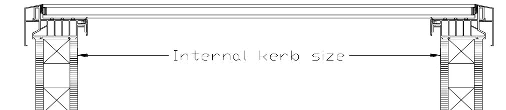
FRONT ELEVATION (DEPTH)

Please note the Atlas Rooflight must be installed at a minimum pitch of 5 degrees.